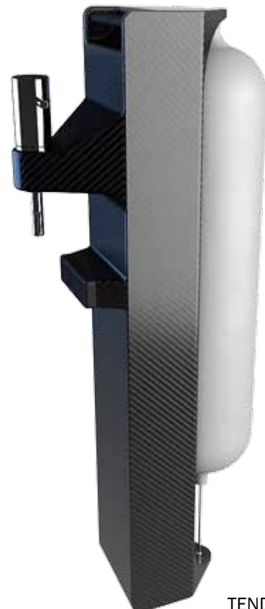
CUSTOM TENDER FENDER