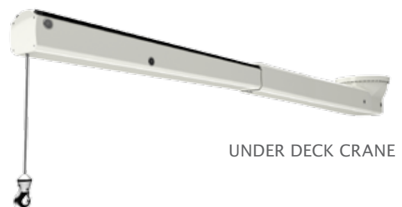
UNDER DECK CRANE