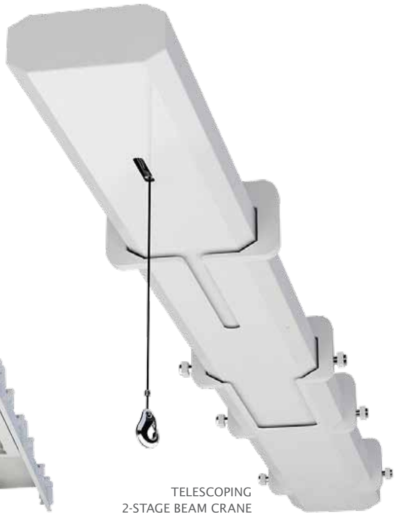
TELESCOPING 2-STAGE BEAM CRANE