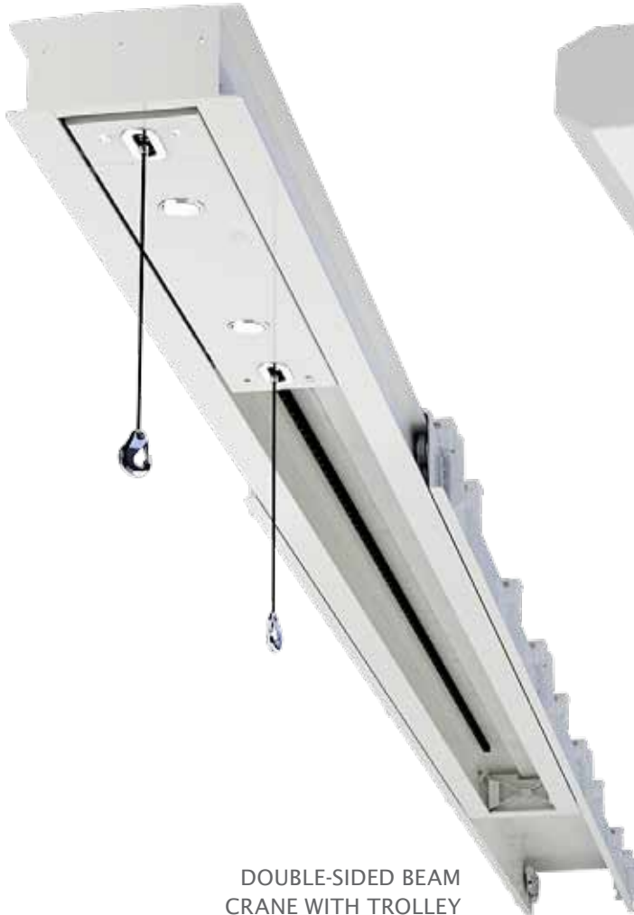
DOUBLE-SIDED BEAM CRANE WITH TROLLEY